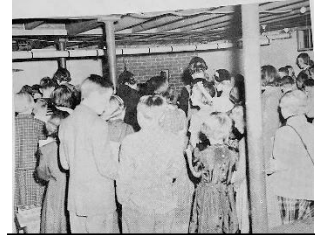
Sunday School in the Merrill House